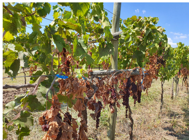
Figure 4. Double Espaldero DOV. Canes and spurs come from the central cordon in the main wire. Canes are placed in lateral wires for better cutting performance. Renewal spurs are placed on the main cordon.

The following variables were recorded after three growing seasons in 2022: total number of shoots, number of shoots per metre, number of clusters, shoot length (m), leaf area (LA) ( \text{cm}^2 ), yield per plant and per hectare ( \text{kg/m}^2 - \text{t/ha} ), and drops in production (%) due to manual and machine harvest. All these