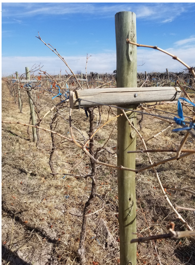
Figure 2. Simple Espaldero DOV with only one upper cordon. The middle wire holds the cordon with long canes which are tied to the lateral wires at both sides of the middle one.

A completely randomised design was performed with two treatments: 1) simple Espaldero DOV and 2) double Espaldero DOV (hereafter referred to as ES and ED), with three replicates of 100 m each one and six plots in total. Two experimental groups conformed by four vines were selected from each replicate. The average of each replicate was calculated for all the variables. The canes were cut at the end of January, when the grapes reached 21°Brix content.