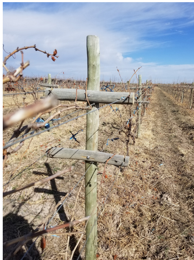
Figure 3. Double Espaldero DOV with two cordons (upper and lower).